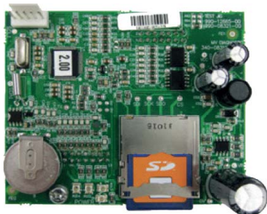
MV Diagnostic Board 8 M-Series MVE Soft Starter www.aucom.com

Support download log and event to csv files using software